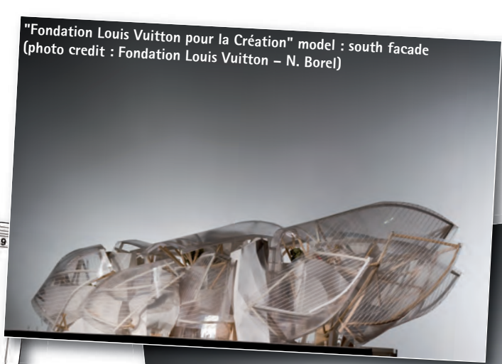
"Fondation Louis Vuitton pour la Création" model : south facade