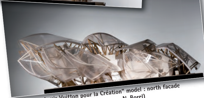
"Fondation Louis Vuitton pour la Création" model : north facade