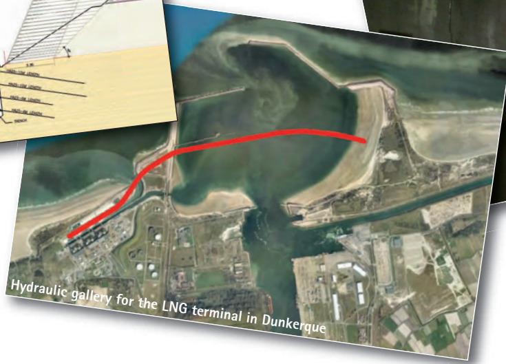
Hydraulic gallery for the LNG terminal in Dunkerque