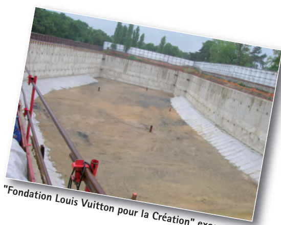
"Fondation Louis Vuitton pour la Création" excavation