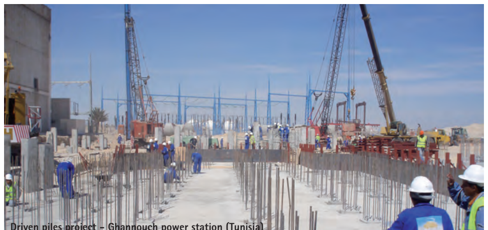
Driven piles project - Ghannouch power station (Tunisia)